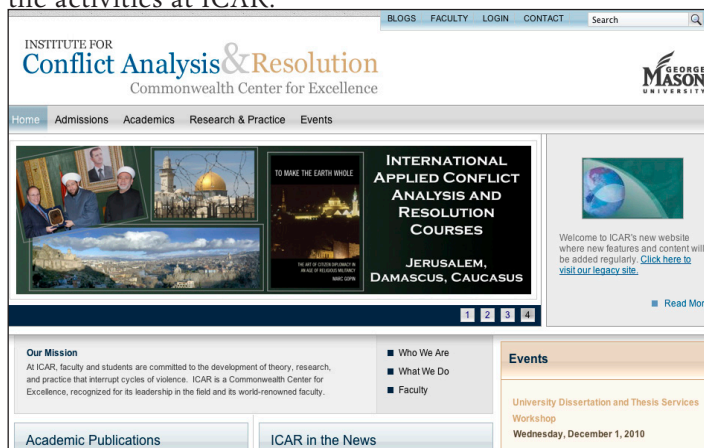
Screenshot of the new ICAR website.

You are invited to visit the site at: icar.gmu.edu