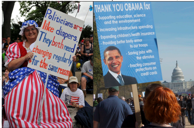
Opponents and supporters of President Barack Obama.

One of the challenges for the field of Conflict Analysis and Resolution is to develop its analytic tools and practical techniques to deal with the problems of political conflict in general and domestic political conflict in the United States in particular. There is little doubt that the heart of the field is devoted to bloody conflicts between ethnic rivals in the far-flung places that we have all come to know with a striking intimacy, but it is impossible to ignore the problems in ICAR's backyard that carry hints of intractability. The tumultuous transition from the 2008